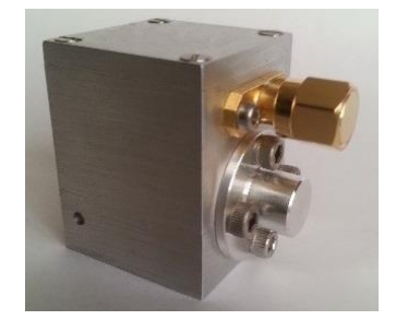
Figure 1. Narrow Band Gunn Oscillator module

Linwave Technology offer a range of Gunn Oscillator modules from 30 GHz to 110 GHz which can be customised to meet specific requirements.